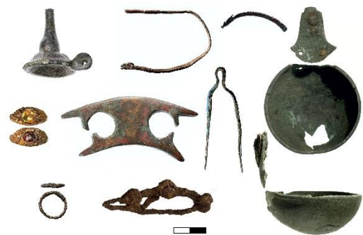
Selected metal finds featured in Jebel Khalid 7: Part 2