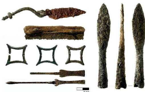
Selected metal finds featured in Jebel Khalid 7: Part 1

This seventh and final volume in the Jebel Khalid series presents the nearly 4000 metal finds recovered over almost a quarter of a century of Australian fieldwork at the site. It comes in two parts, the first presents the military finds and horse fittings, blades, various tools, weights, and metal waste. The second is devoted to fittings and fasteners, household items, and objects for personal use, such as bangles, finger rings, and earrings. Both include richly illustrated catalogues and detailed commentaries that explore the significance of the metal finds during the site's major periods of activity.